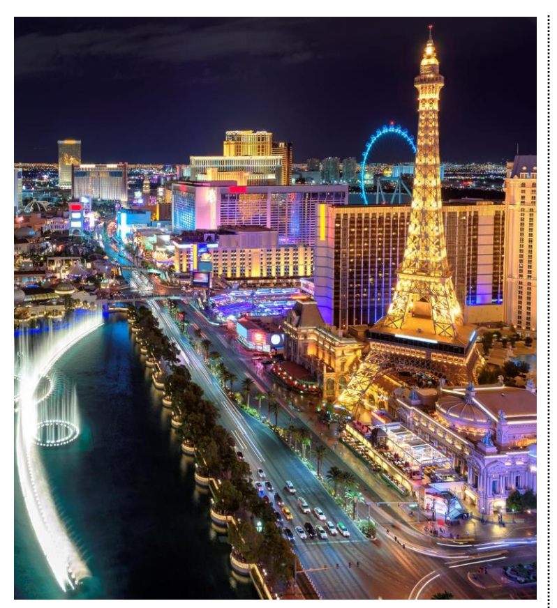
9 Days • 11 Meals: 7 Breakfasts, 2 Lunches, 2 Dinners

HIGHLIGHTS... Colorado National Monument, Moab, Arches National Park, Canyonlands National Park, Dead Horse Point State Park, Capitol Reef National Park, Bryce Canyon National Park, Zion National Park, Las Vegas